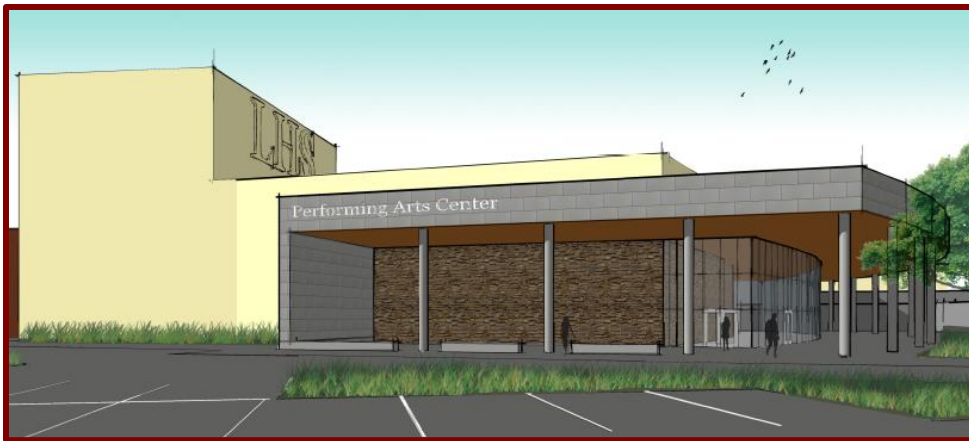
Rendering of Performing Arts Center Entry