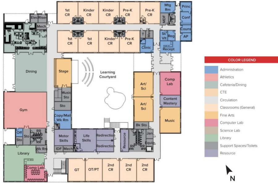
FLOOR PLAN - FIRST FLOOR